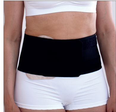
Vira Rak 15 cm, 50230