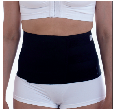
Vira Rak 20 cm, 50231