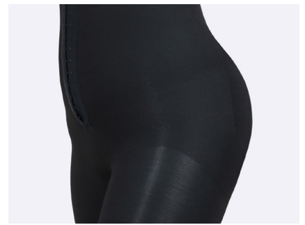
Shaped knitting to follow the body contour.