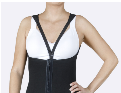
The adjustable shoulder straps can be attached in the middle front or sides.