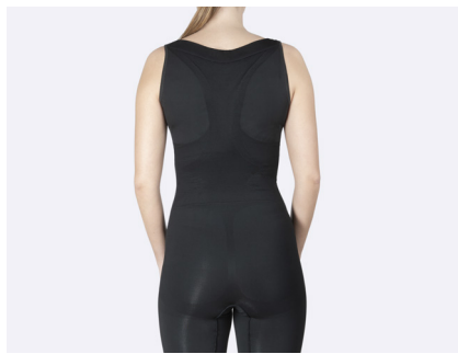
Wide cut in the back and flexible fit.